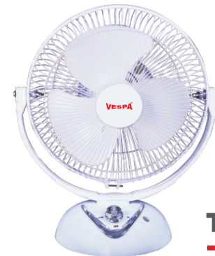
TABLE FAN 16"