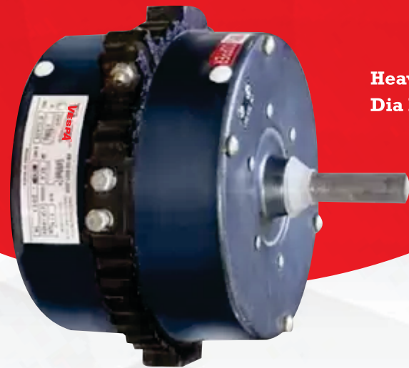
Heavy Duty 1-10 | 32mm Dia Motor